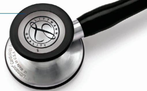
3M™ Littmann® Cardiology IV™ Stethoscopes and 3M™ Littmann® Classic III™ Stethoscopes

Designed to provide excellent sound quality over a lifetime of use, chestpieces are crafted with stainless steel and high-density zinc alloy due to their excellent acoustic properties and their strength to resist impacts, scratches and chemicals. Double-sided chestpieces have precision stems that rotate smoothly and click into position.